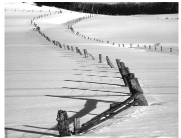
How many days 'til spring?

"In the end, I think it just came down to the fact that we have a highly experienced group of professionals that are sharply focused on providing extraordinary service", she added.